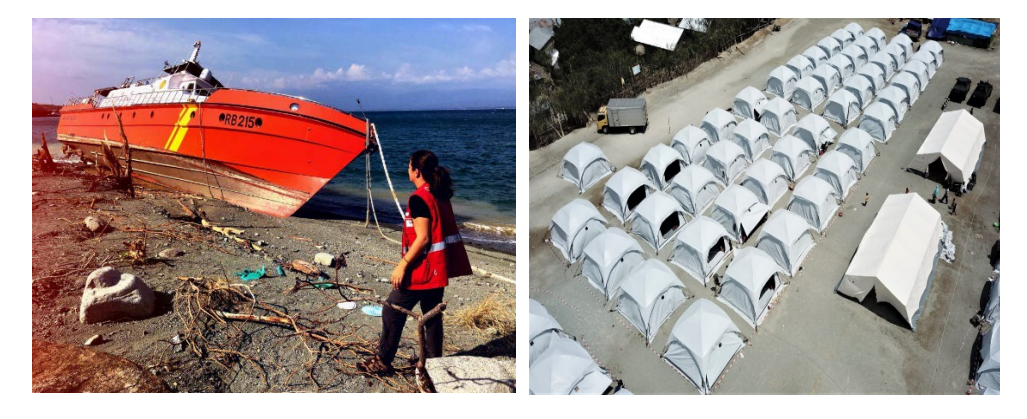
In October 2018, a Swiss Rapid Response Team with support from the SDC Regional DRR and Rapid Response Advisors provided emergency support (shelter and WASH) to tsunami-affected population in Sulawesi, Indonesia.

Federal Department of Foreign Affairs FDFA Swiss Agency for Development and Cooperation SDC Humanitarian Aid and Swiss Humanitarian Aid Unit