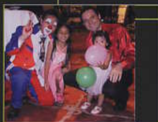
⤴ Nobody is afraid of clowns.