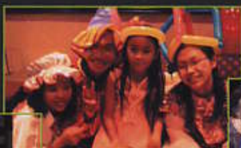
⤴ Kids did enjoy the festivities as well.