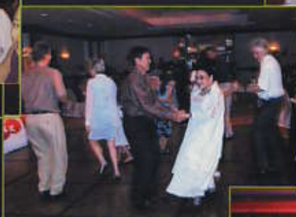
<< We should have danced more often.