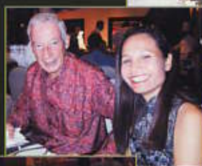
<< The president likes beautiful ladies.